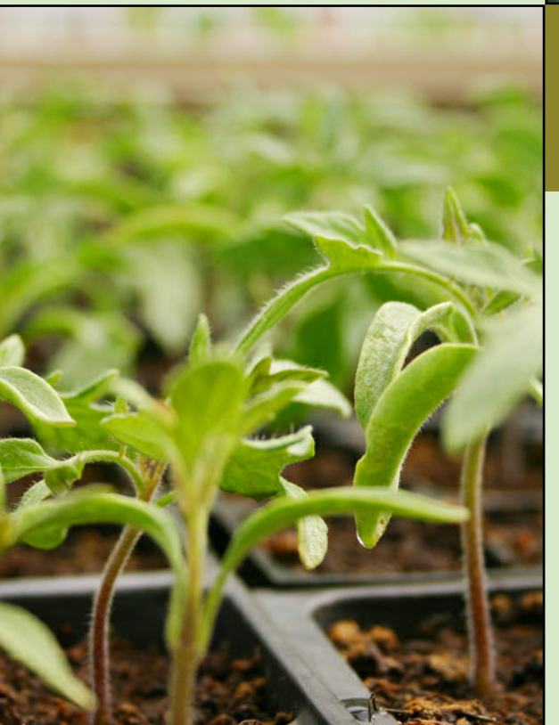
Edinburgh Garden School